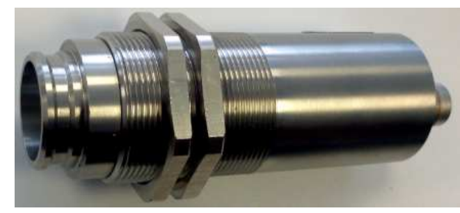
Sirius pyrometer's rugged stainless steel housing

Lenses: The infrared energy radiated by the target is collimated directly onto the detector via the lens and is digitally processed to provide optimum performance. Choose from the lens selection chart below for exact focus distance and spot size to meet the target size requirement. Lenses are made of an optical glass which is highly transparent in the spectral region of this model. If additional windows are necessary, they must offer similar optical characteristics.